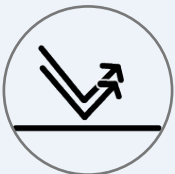
GLARE FREE Viewing