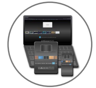
CONTROL From any device