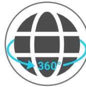
360° VIEWING Captivate your audience